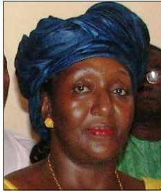
The First Lady of Sierra Leone, Her Excellency Sia Koroma