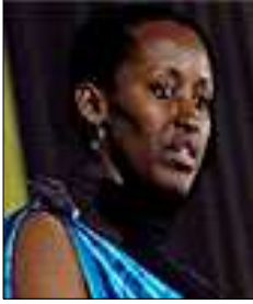
The First Lady of Rwanda, Her Excellency Jeannette Kagame