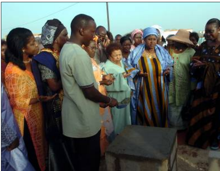
Groundbreaking of the Pan African Center for Gender, Peace and Development

The Centre project was launched during the 1 st edition of the African Gender Forum and Award, that took place in 1-2 May 2005, in Dakar, Senegal.