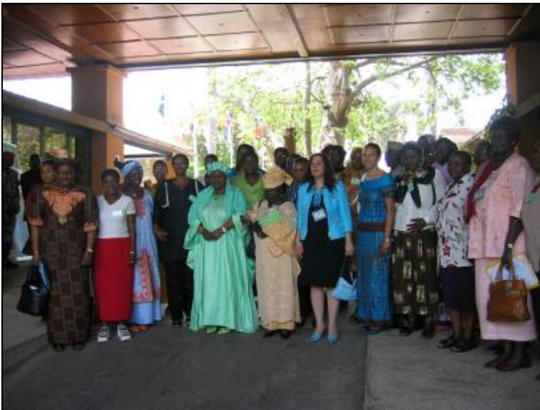
Participants with the vice-president of Gambia

The meeting also saw the organization of a press conference during the AU Summit during which members of the Campaign and FAS members were interviewed.