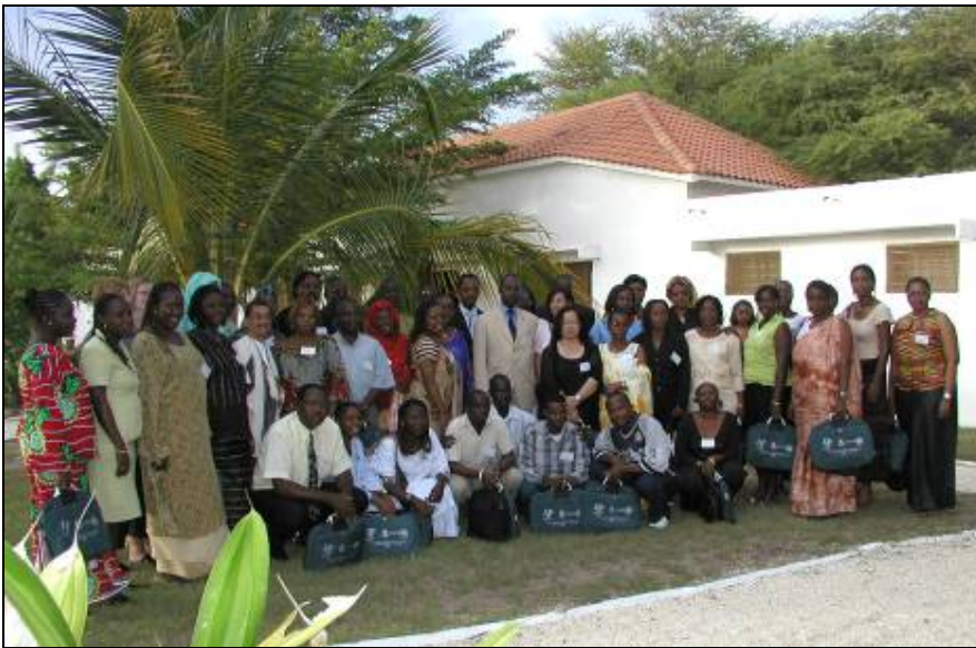
Participants at the Short Course in Mbodiène